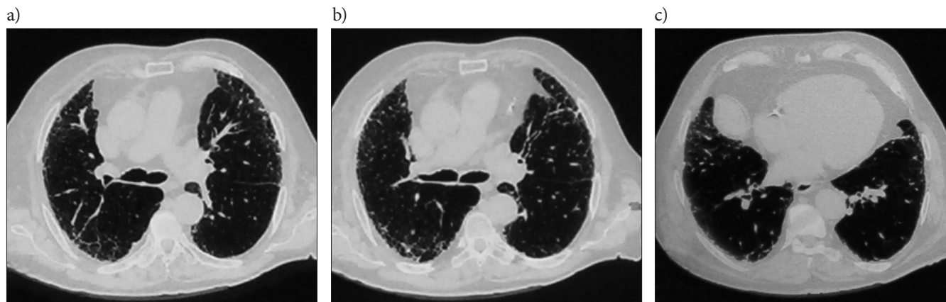
Selected axial slices through the lower lung fields (a–c) show bilateral, subpleural reticular opacities at lower fields. Traction bronchiectasis and honeycombing, in absence of any nodules or ground-glass opacities were more evident in the lower slices (b and c) whereas in the upper lobes (a) signs of emphysema without any significant air entrapment were remarkable / Wybrane przekroje osiowe dolnych pól płucnych (a–c) pokazują podopłucnowe siateczkowate zaciemnienia. Rozstrzenie i objawy plastra miodu, przy braku guzków lub ognisk typu matowej szyby, są bardziej widoczne na dolnych przekrojach (b i c), natomiast oznaki rozemdy bez znacznych pęcherzy powietrza – na przekroju przez górne płaty (a).

Photo 2. High resolution computer tomography (HRCT) – case No. 1